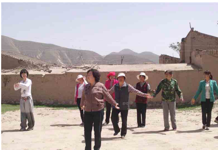
GCB worker and volunteer teach the women dance to rich their free life.

series of women's interest groups in Niuhe village this year, donating audio equipment, CDs and other materials to the community. Group activities have included embroidery meet-ups, women's dance sessions, and crafts workshops. Under the leadership of Liu Xiaomei 15 female representatives are now actively involved in the organization. These activities enrich the cultural lives of the women, and provide the village's women with opportunities and a platform for self-expression.