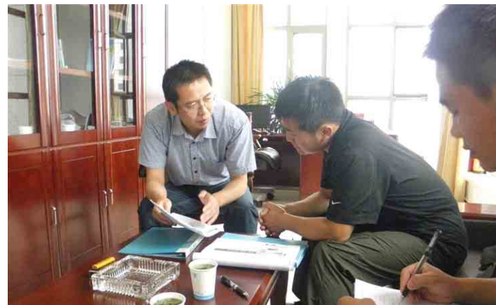
GCB staff apply the information disclosed to government.

First, Green Camel Bell extended the understanding of laws and regulations. Our public welfare lawyer regularly holds public lectures, and learning and sharing activities for Green Camel Bell staff and volunteers. Staff and volunteers gained basic knowledge of environmental laws and regulations, the government's information disclosure system, and the law of environmental impact assessment, and so on. These studies have significantly helped Green Camel Bell to carry out its work.