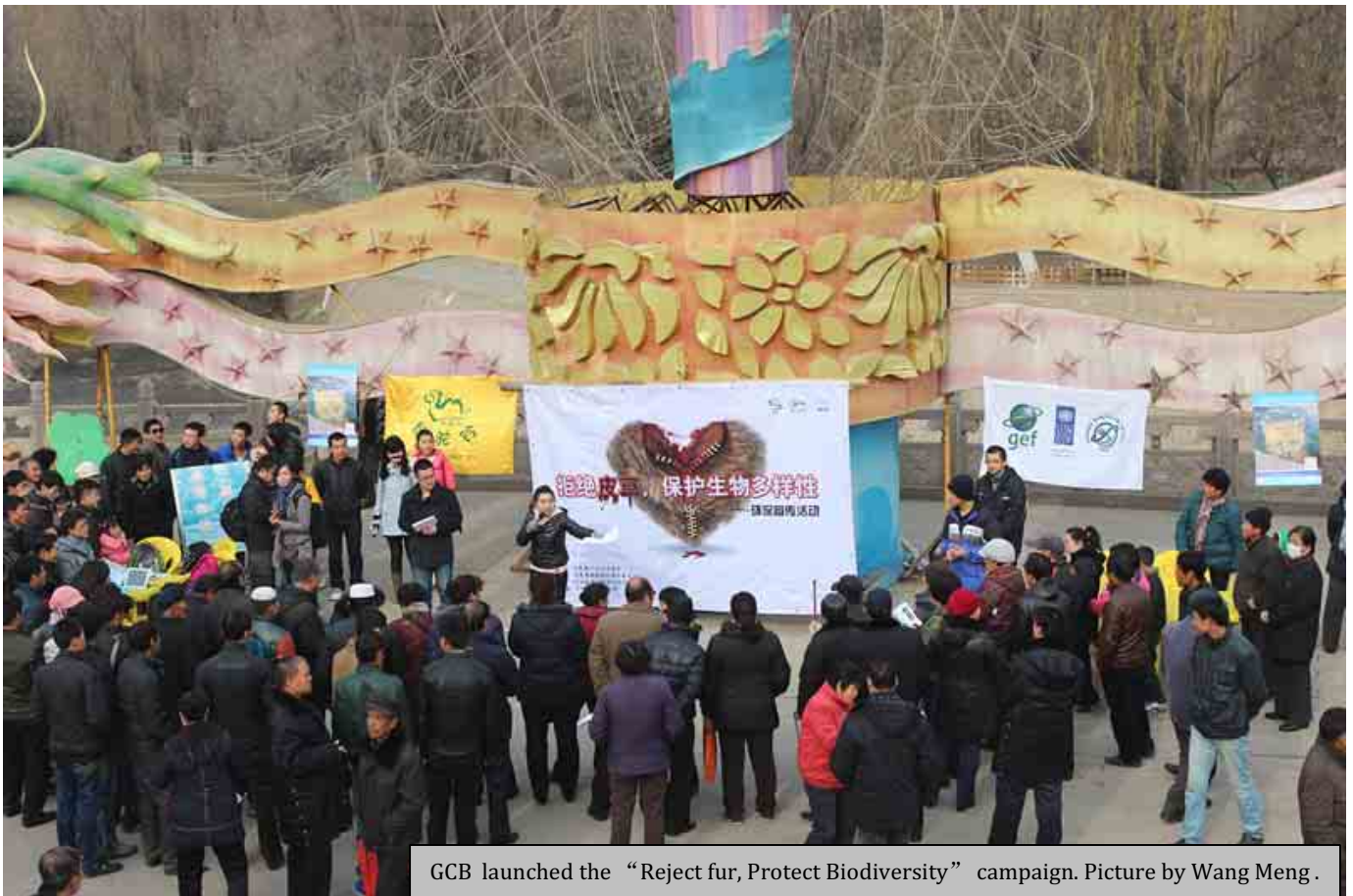
GCB launched the “Reject fur, Protect Biodiversity” campaign.

Green Camel Bell has continued to launch important initiatives with the Beijing Water Conservation Foundation and advance our volunteers' activities in 2012, based on the lessons learnt from past joint initiatives.