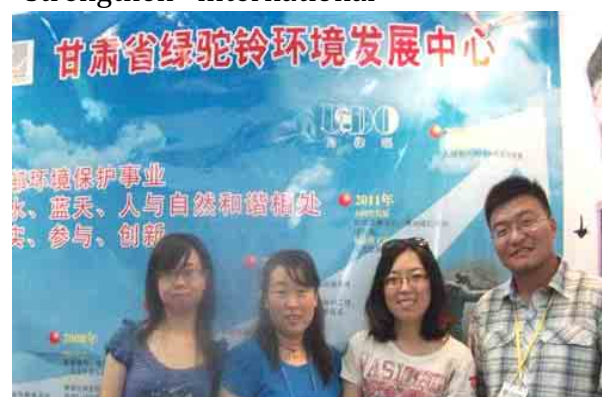
GCB worker and volunteer took part in the shenzhen welfare charity session.

In 2012 GCB received considerable media attention, with 12 stories in various media outlets. 28 people from 14 non-government organizations and scientific research institutions visited our office, working with our staff members on environmental protection issues. We also established a partnership with the Northwest University for Nationalities, launching Green Camel Bell as the “Northwest University for Nationalities teaching