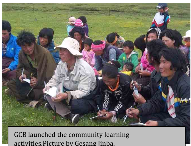
GCB launched the community learning activities.

With environmental protection as its starting point, community at its center, and demand as its guide, the project has been able to carry out a wide range of community activities. GCB invited professional doctors to teach general knowledge of family hygiene, prevention and treatment of common diseases, precautions in caring for children and the elderly, and physiological and reproductive health guidance for herders. In basic skills training, Green Camel Bell organized for herders to learn basic computing skills, held sewing lessons for the women, and helped herders develop other skills that could support their livelihood. Additionally,