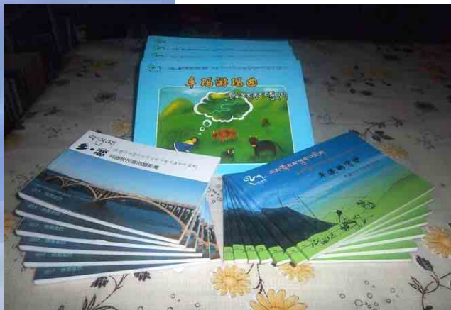
Some environment educational books made by GCB.

and built the 'Local Youth Environment Education Platform' in Maqu County's Awancang Primary School. On the 1-3 August 2012, GCB also held a 'Bilateral Forum on Environmental Protection and Sustainable Development - looking at our water sources' in Awancang town, encouraging communications between Maqu and the outside world.