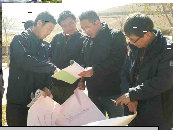
GCB expert and volunteer do the evaluation in Jingyuan.

Through this project Green Camel Bell hope that NGOs might become better integrated into rural areas, that the farmers understand the project's content, and in particular to ensure that women participate, whilst making sure that the implementation process is fair, open, just and and ultimately promoting sustainable community development.