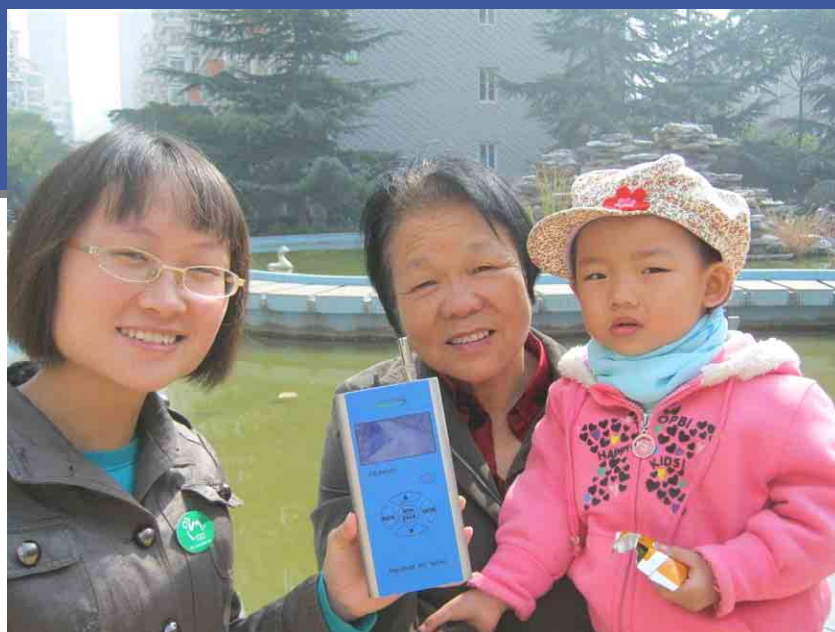
GCB volunteer teach the resident in community how to test the PM2.5.

The Lanzhou Air Observation Mission was officially set up in September 2012 to investigate the formulation and implementation of Lanzhou's air pollution control policy, to keep the public informed and to undertake a public evaluation. The findings and recommendations of the evaluation were submitted to the relevant government departments.