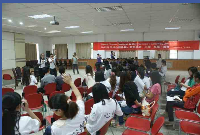
Site of activity about the "2012 Lanzhou International Community Drama Environmental Education Forum".

Lanzhou implemented the 'Full Sewage Collection and Treatment' project in 2009, laying 357 kilometers of rain water pipe network and constructing five sewage pump stations and three sewage treatment plants.